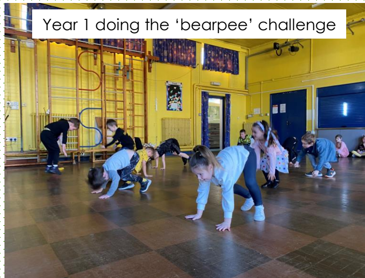
Year 1 doing the 'bearpee' challenge